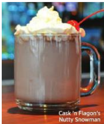
Cask 'n Flagon's Nutty Snowman