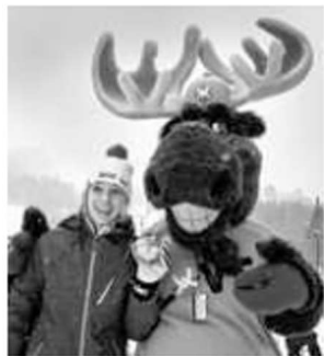
Olympic gold medalist Hannah Kearney.

Head to Waterville Valley Resort Dec. 27 and 28 to meet and ski with Olympic gold medalist Hannah Kearney. The world champion freestyle skier won Olympic medals in 2010 and 2014, and has competed in 10 World Cup Championships, taking away six moguls titles and four overall titles. She plans to ski with guests at Waterville Valley Resort in the morning, and then stick around until 1 p.m. for photos and autographs in either the courtyard or on the second floor of the base lodge, depending on the weather. The ticket office opens at 7 a.m. and lifts start running at 8 a.m. Columbia Sportswear will also raffle off winter gear. Lift tickets: $57-$77, or save up to 55 percent by booking in advance online. 800-468-2553, waterville.com.